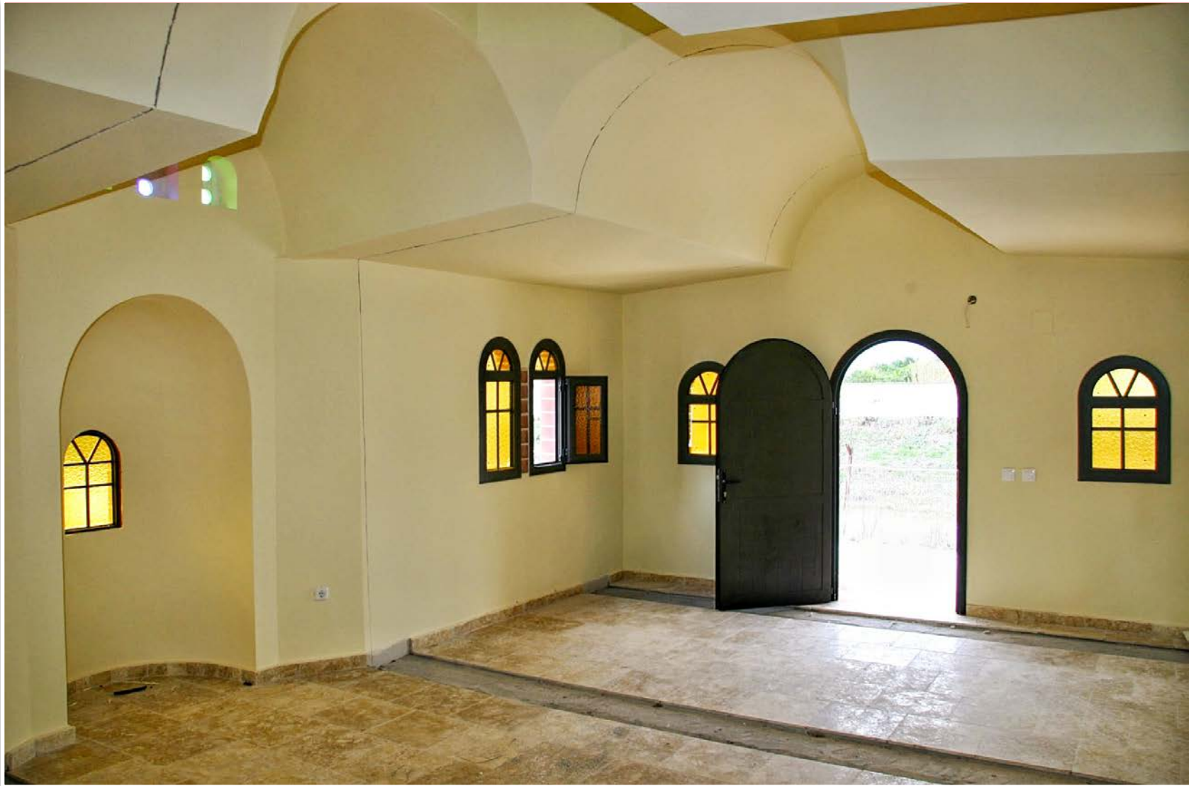
❖ Sample interior