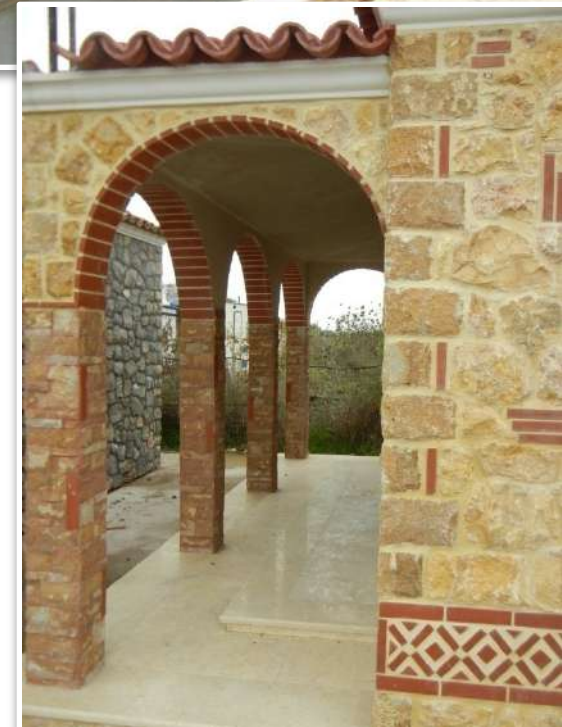
❖ Beautiful longer narthex with columns