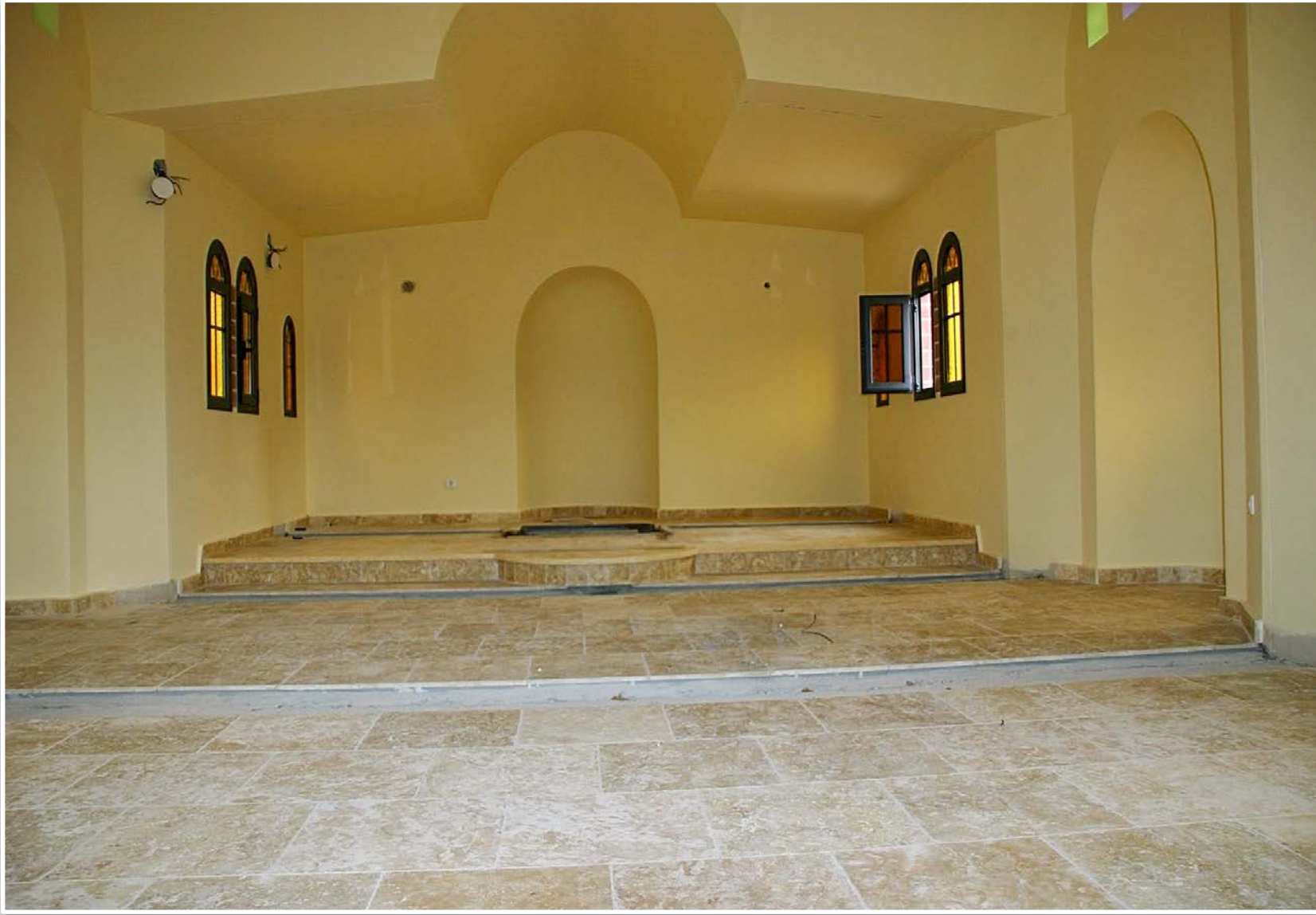
❖ Sample interior