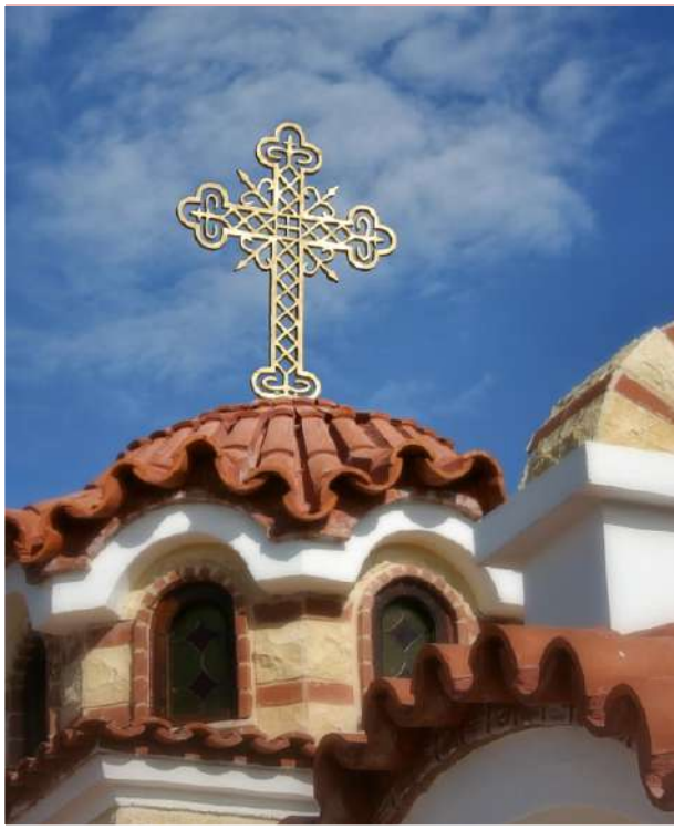
❖ Massive large bronze cross